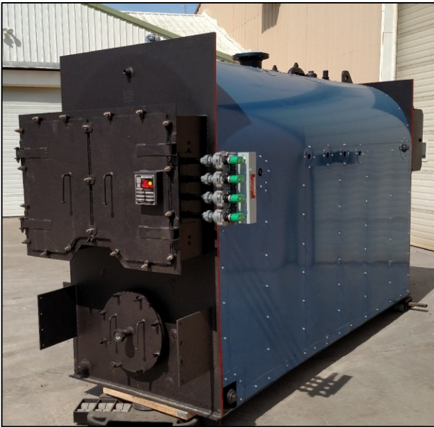
Hybrid Boiler Unit.