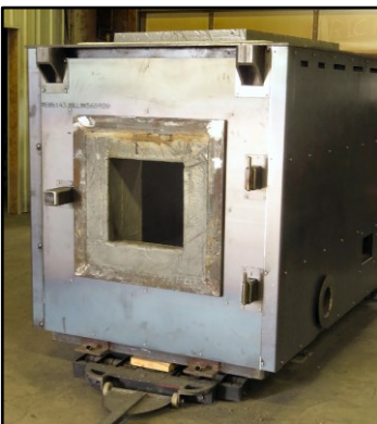
Combustion unit under construction.