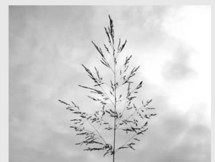
Open-branched, reddish panicle