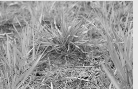
Tillering of windgrass in wheat