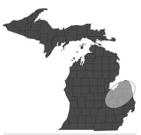
Common distribution of windgrass in Michigan