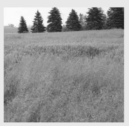
Windgrass in a Michigan wheat field