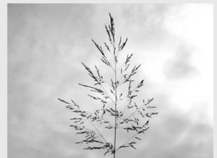
Open-branched, reddish panicle