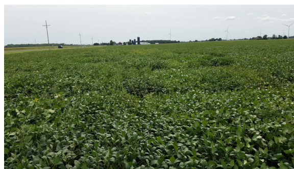
Tuscola County organic soybean variety trial, September 8.