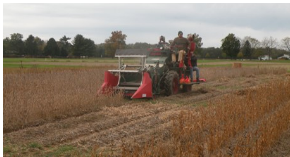
Harvesting the Kalamazoo site, October 19.

Growers should note seed size when selecting planting rates. Planting rates should be based on number of seeds per acre and not on pounds per acre. It often benefits growers to select a few good varieties for planting each year. Yield determination and careful field evaluation during the growing season will add to the grower's knowledge of variety performance and allow for better selection.