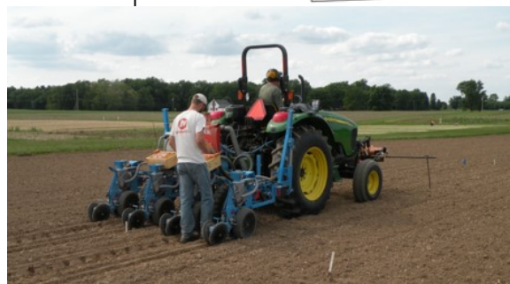
Planting soybean plots in Kalamazoo Co, June 7.