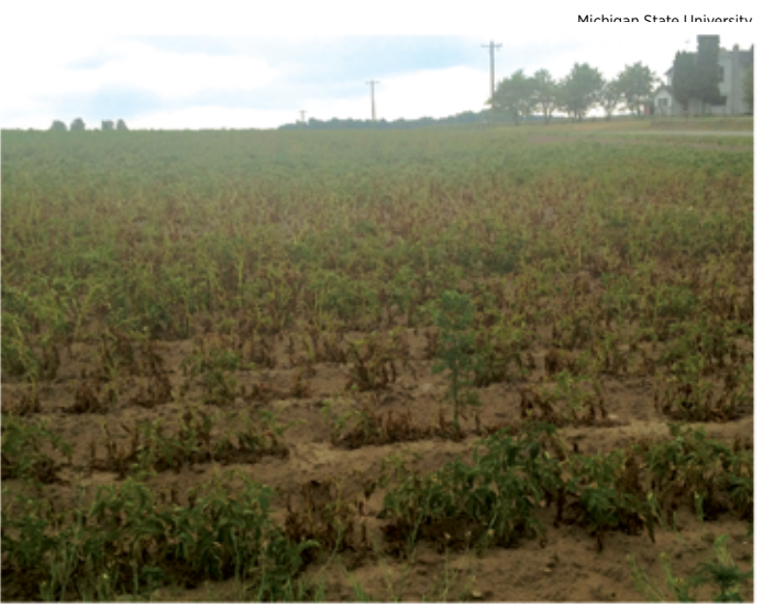
Figure 5. Significant crop loss due to high populations of V. dahliae.