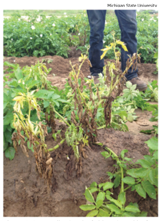
Figure 2. Stem yellowing, leaf chlorosis and leaf necrosis are common symptoms of a plant infected by Verticillium dahliae.

soil. In the spring, root secretions stimulate microsclerotia germination and the fungus penetrates the root tips directly or through wounds caused by root-lesion nematodes. Once the fungus enters the root, it colonizes the root cortex and mycelium can enter into xylem vessels (Figure 7). After the fungus has entered the xylem it moves through the vascular system as conidia. As the fungus colonizes the vascular system, chlorosis, necrosis and foliar wilting begin to occur.