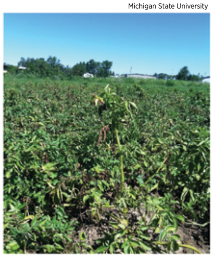
Figure 1. Early senescence due to infection by Verticillium dahliae.

While potato early die can occur from infection with V. dahliae alone, earlier onset occurs when both the fungus and the nematode are present. The presence of potato early die complex in a potato cropping system can lead to as much as a 50 percent decline in yields. As the disease develops during the season, it tends to be most severe during the tuber-bulking period. The diseased plants are unable to generate significant tuber size, decreasing total marketable yield and quality.