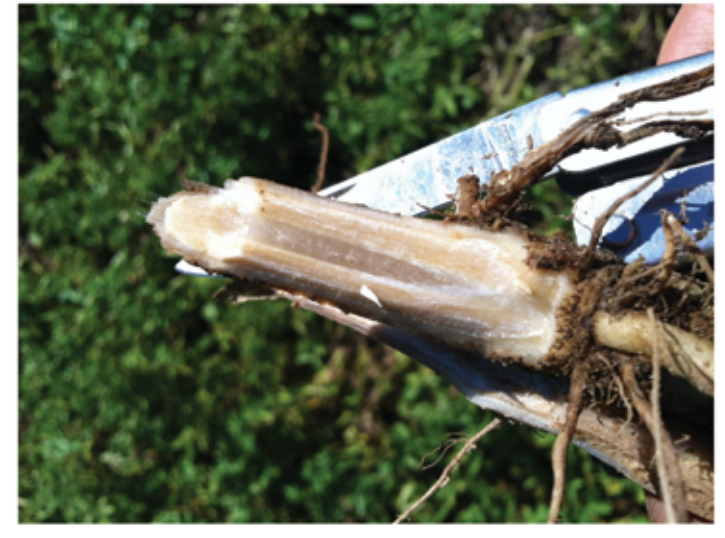
Figure 3. Mycelium will plug the xylem causing the vascular tissue to turn brown and display a wood-like appearance.