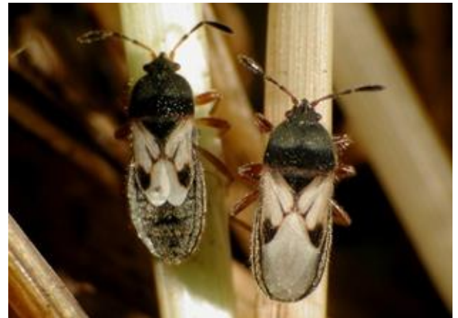
Chinch bug adults. Fred Baxendale