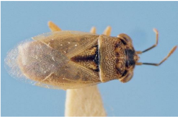
Bigeyed bug, a predator of chinch bugs.

Bigeyed bugs are beneficial insects. As the bigeyed bug also frequents home lawns, it may be mistaken for chinch bug. Bigeyed bugs are about the same size, but can be distinguished by their large, bulging eyes, gray to silver color and quick movements. Bigeyed bugs feed on chinch bugs and other small insects. Bigeyed bugs are sensitive to insecticides. Encourage bigeyed bugs or other predators by avoiding the use of insecticides, except for treating small areas that are heavily infested with chinch bugs. An insecticide application to the whole yard may eliminate all of these predators and cause a resurgence of chinch bugs in following years.