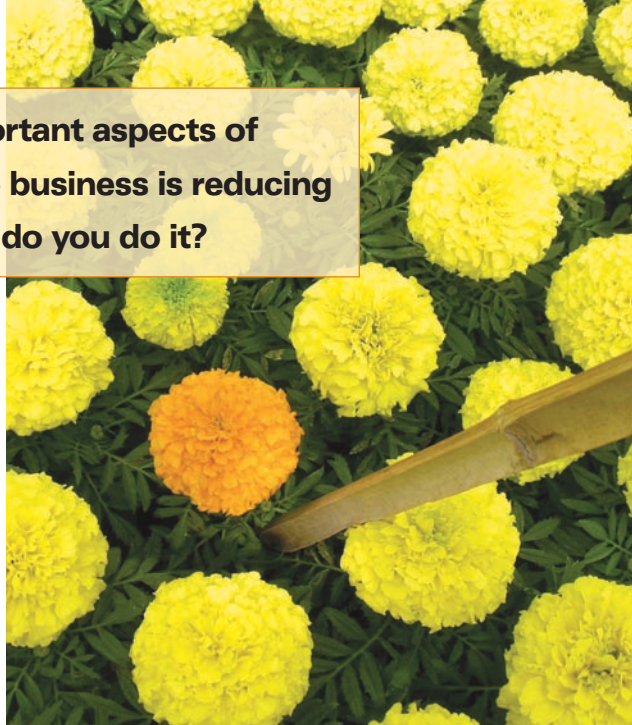
Figure 1. Shrinkage may occur when cultivars do not germinate true to type from seed.

At 10 percent shrink (about the average at retail), Dick and Jane will realize a net profit of only $200. At 20 percent shrink, they will lose money on the crop. Shrink works against us in two ways – it raises the cost that it took to produce each saleable container, and it reduces the number of containers we