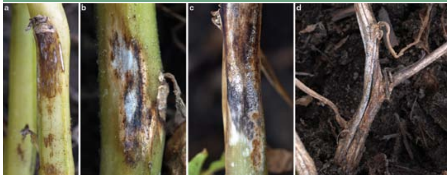
Figure 3. Black dot stem lesions start out as pigmented flecks (a). Lesions may coalesce developing irregularly shaped, white to straw-colored centers (b) and eventually girdle the stem (c). Microsclerotia form in lesion centers (c). Late in the season after or after vine kill, microsclerotia may cover the base of the plant near the soil surface (d).

level late in the season and after vine kill (Fig. 3d).