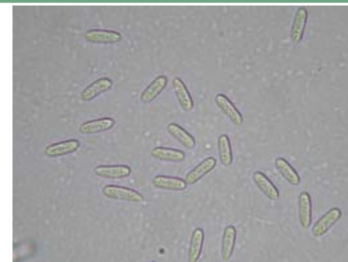
Figure 5. Spores of the black dot pathogen Colletotrichum coccodes .

Effective management of black dot requires implementation of an integrated disease management