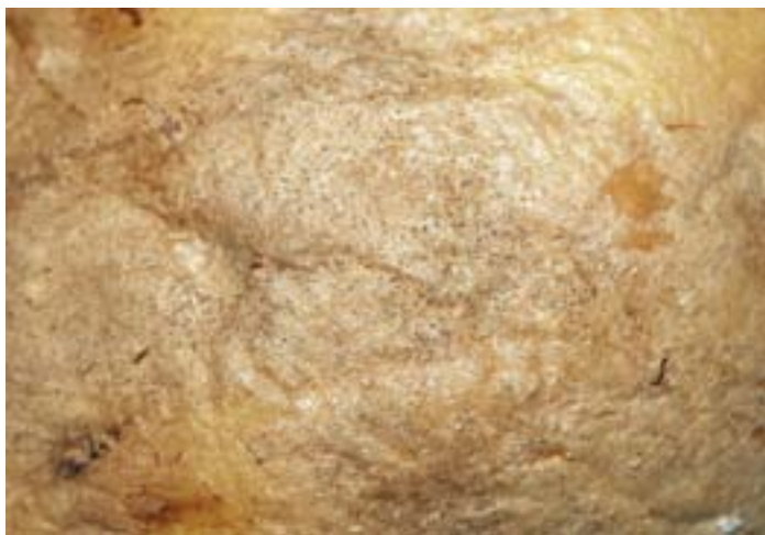
Figure 1. Black spots on the surface of a black dot infected tuber. These are microsclerotia of the black dot pathogen Colletotrichum coccodes .

Black dot is named after the abundant black dots