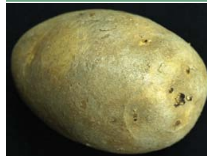
Figure 4. Tuber symptoms appear as a brownish gray discoloration over a large portion of the tuber.

Infection of below-ground plant parts continues throughout the growing season, especially when plants are under stress, such as during long, warm dry periods. Production of microsclerotia is greatest at high temperatures and increasing disease incidence has been associated with increasing soil temperatures. Colonization of tubers can occur at all stages of development, but formation of sclerotia on the tuber surface is more prevalent late in the season