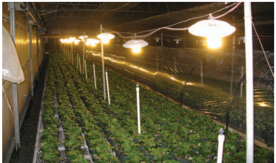
Figure 1. Greenhouse photoperiodic lighting using both incandescent and compact fluorescent lamps.

The number of hours of light in a 24-hour period (photoperiod) controls flowering of both short-day and long-day crops.