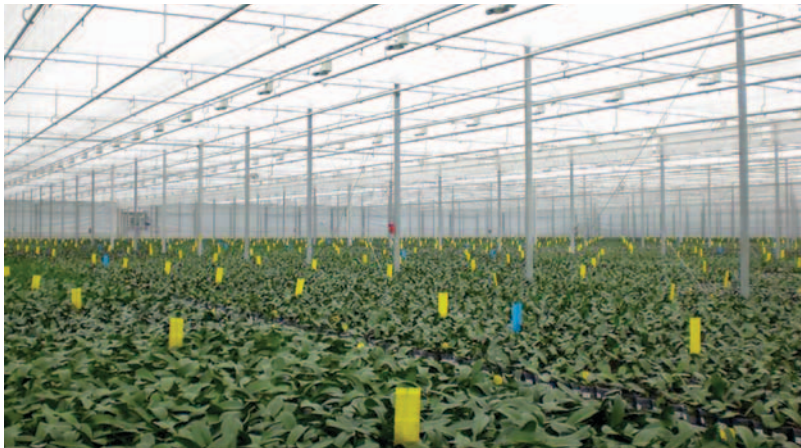
Figure 2. Greenhouse supplemental lighting of potted flowering orchids (photo courtesy of P.L. Lighting).

Young plants are often produced from December to March when the solar DLI in greenhouses can range from 1 to 12 mol·m -2 ·d -1 in northern latitudes, thus requiring supplemental lighting (Figure 4a and b). Purdue University and Michigan State University research recommends a target DLI of 10 to 12 mol·m -2 ·d -1 for young plants. When the DLI is lower than this, uniformity, quality and timing can be negatively affected. For example, young plants may have delayed root and shoot growth and become elongated and weak. By providing a DLI of 10 to 12 mol·m -2 ·d -1 , time to produce a marketable liner or plug tray can be reduced by 25 to 50 percent.