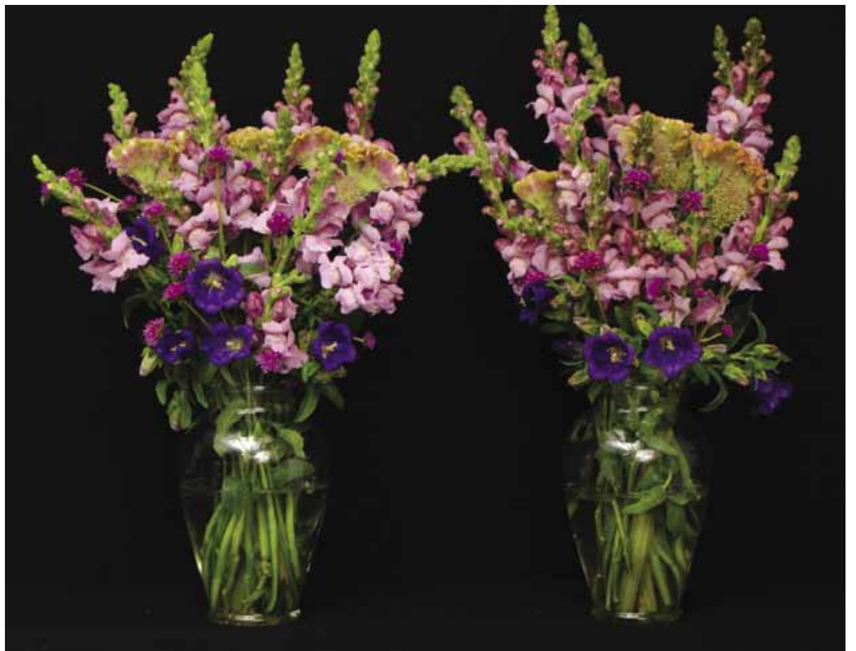
Figure 1. Example of a mix bouquet of specialty cut flowers grown in a high tunnel (left) or field (right) production system.

Traditionally, highly mechanized greenhouses were used for cut flower production; however, open field and high tunnel production systems are now used for specialty cut flowers. The relatively low cost of growing specialty cut flowers in the field may be appealing, but the risk of extreme weather, seasonal production and limited control can be troublesome. Previous Purdue University floriculture research compared spring and fall high tunnel to field-grown specialty cut flower production of