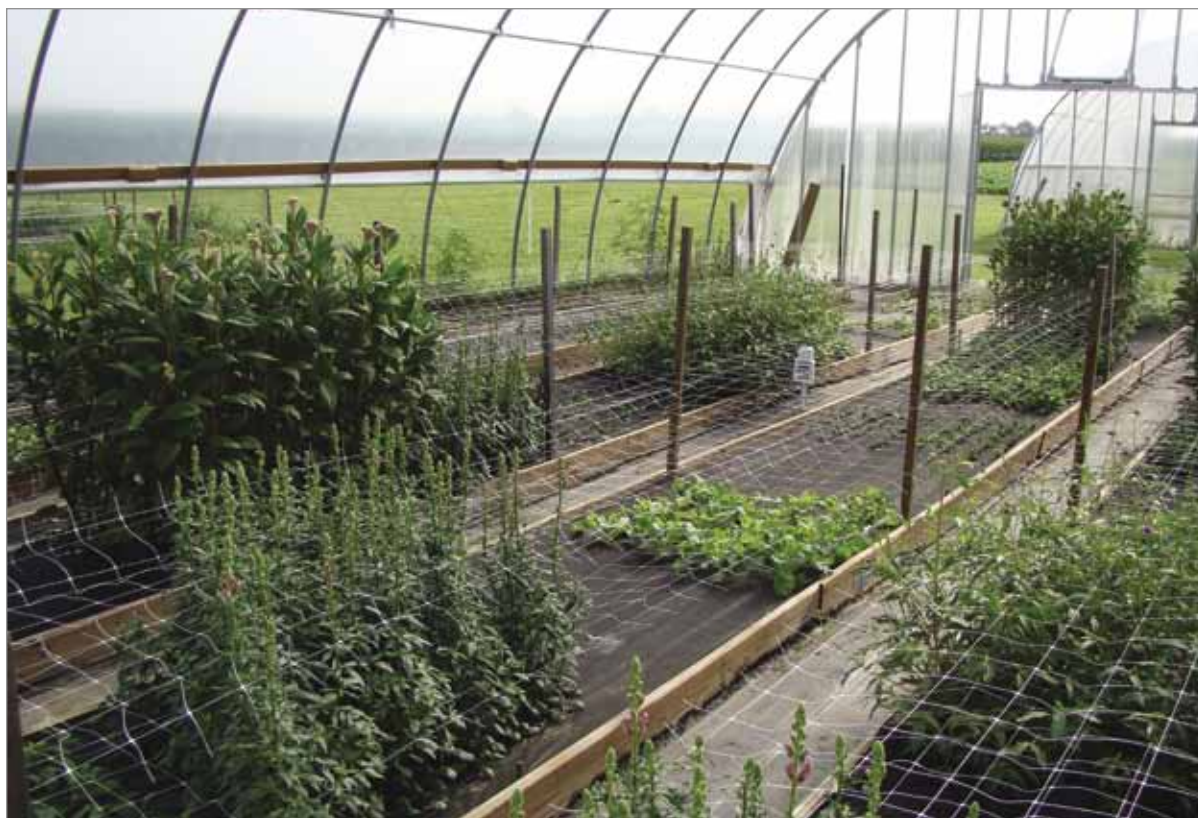
Figure 2. Summer production of specialty cut flowers grown in a high tunnel at Purdue University’s research farm.

Harvesting and Determining Quality, Marketability and Yield. Stems were harvested three days a week when one third of the flowers or florets were open on a single stem. The total number of stems harvested per week and the duration of the harvest period were recorded to determine the crop production cycle and potential succession plantings. The total number of stems were recorded for 55 days for all species with the exception of eustoma, which was harvested for 23