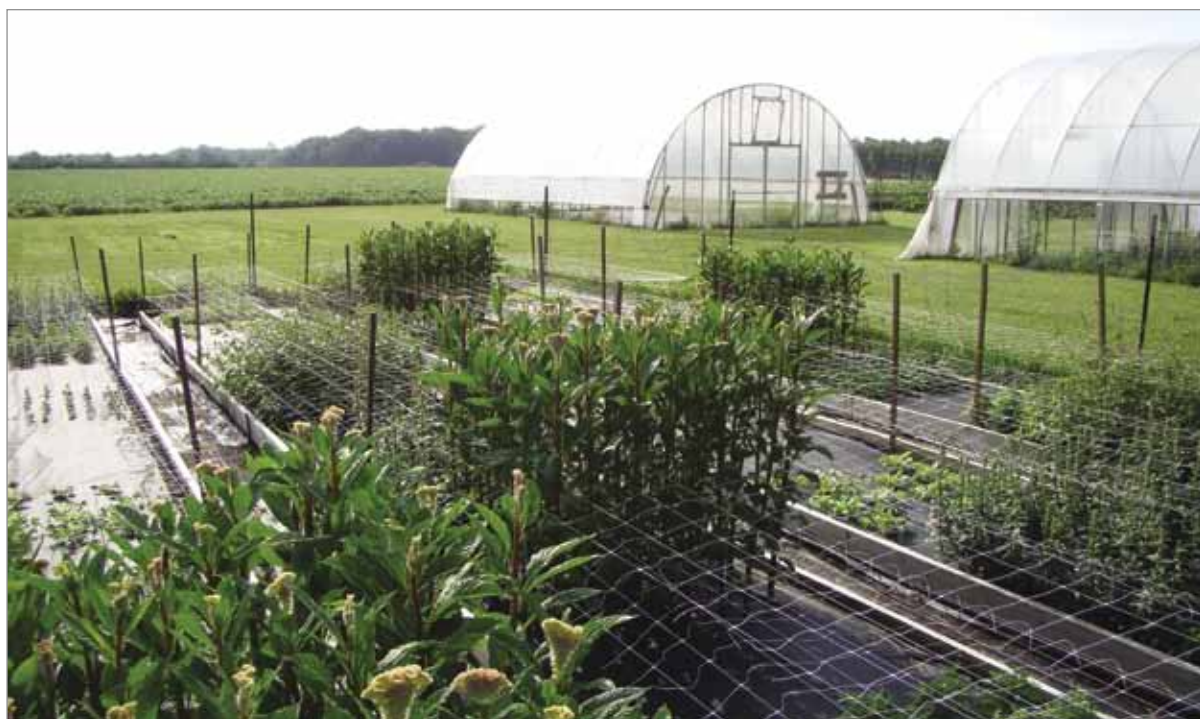
Figure 3. Field production system of specialty cut flowers grown at the Purdue University research farm.

The results obtained from this study again suggest high tunnels offer several benefits for producing most of the specialty cut flower species tested even in the summer. In some cases, both the high tunnel and field production systems resulted in similar quality parameters. Therefore, growers should determine which production system is best for their farm and market. [8]