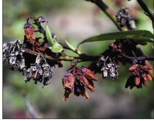
Blighted flowers are brown at first but later bleach to gray.

Scorch is a serious disease of blueberries on both coasts of North America, but it has not been found in the Midwest. In New Jersey, it is also known as Sheep Pen Hill disease, which is caused by a different strain of the same virus.