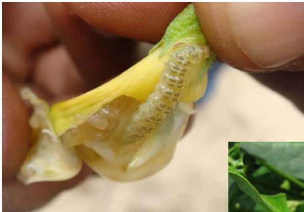
The pest and damage

Cowpea is a key food staple in West Africa but insect pests, especially legume pod borer ( Maruca vitrata ), cause 50-80% yield loss. Chemical pesticides are most common defense used.