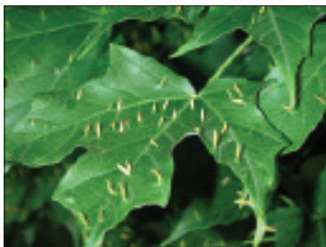
Maple spindle gall on sugar maple.

Management: Treatment is not usually necessary, as lasting harm to plants rarely occurs.