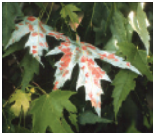
Above left: Maple bladder gall on silver maple. Above right: Erineum patches on undersides of silver maple leaves.