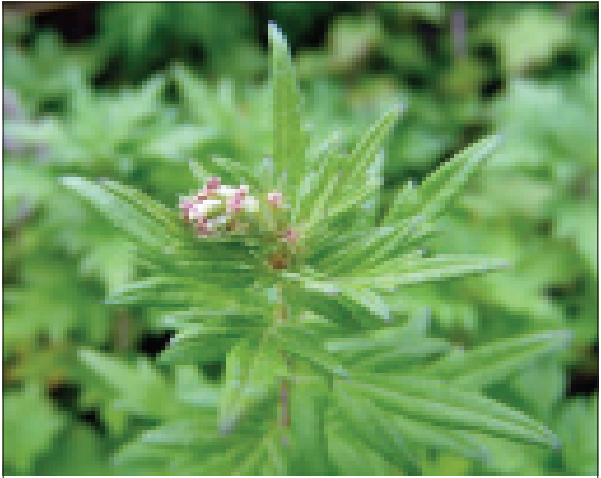
Mugwort flowering stem.