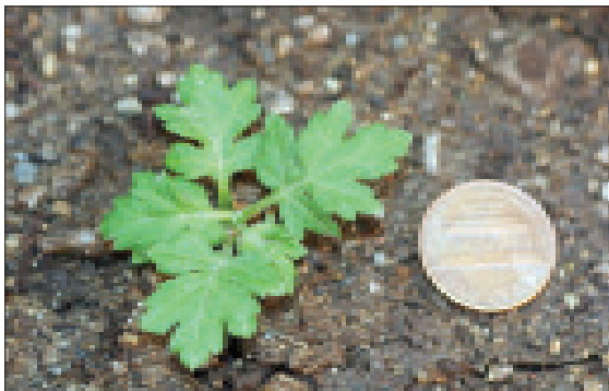
Young mugwort plant.

Persistent, prolific rhizomes and, rarely, seeds.