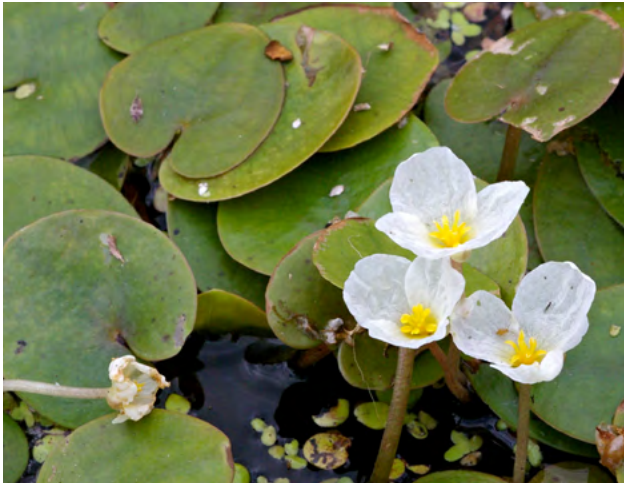
European frog-bit | Hydrocharis morsus-ranae