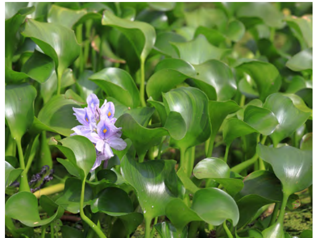
! Water hyacinth | Eichhornia crassipes