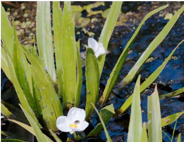
Water soldier | Stratiotes aloides