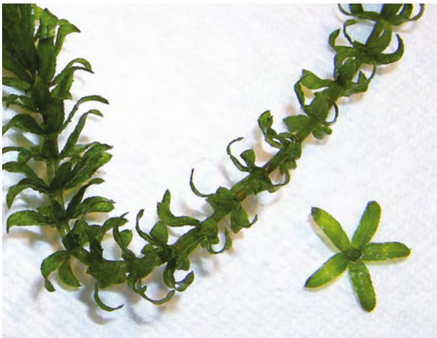
Hydrilla | Hydrilla verticillata