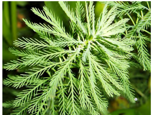
Parrot feather | Myriophyllum aquaticum

Other names: Myriophyllum brasiliensis, Myriophyllum brasiliense, Myriophyllum proserpinacoides and Enydria aquatica