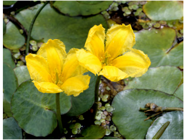
Yellow floating heart | Nymphoides Peltata