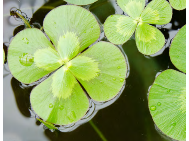
! European water clover | Marsilea quadrifolia