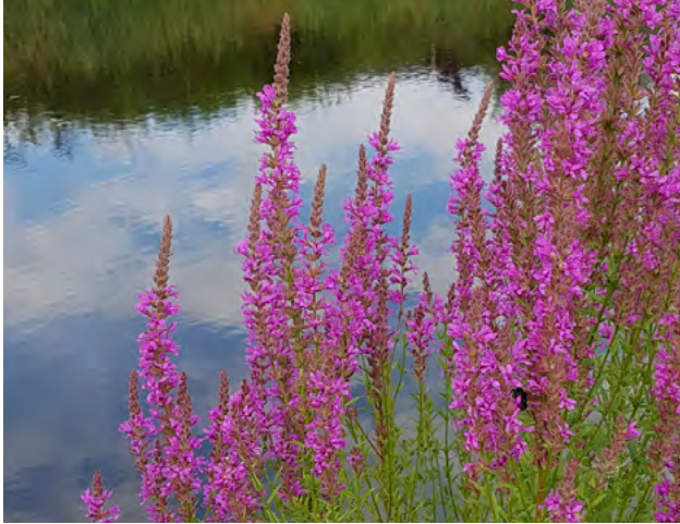
Purple loosestrife | Lythrum salicaria