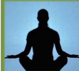
Yoga in the Gardens

For a complete program, a list and description of workshops, other information and online registration – click here