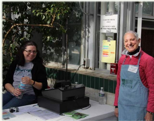
Our staff and dedicated volunteers work hard to make your shopping experience a happy one!