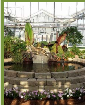
Spring Show and Sale