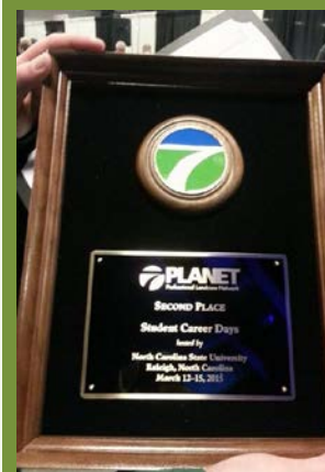
Hort Club Award