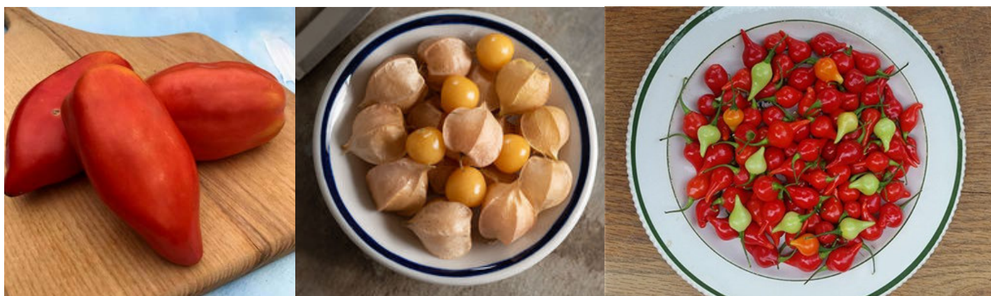
From left to right: Blue Beech Tomato, Goldie Ground Cherry, and Biquinho Pepper

This Cilantro (not pictured) is slow bolting and high yielding and this cilantro has darker leaves and reddish stems compared to other cultivars. It does, however, have the same delightful flavor for my salsa and pico de gallo.