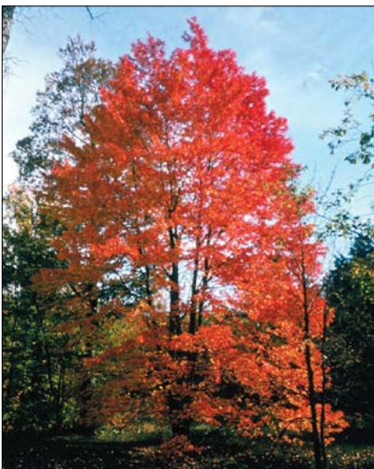
Jesse Saylor, MSU

Pests: Shallow root system and thin bark. Can be chlorotic in alkaline soils. Prone to Verticillium wilt. Leafhoppers and borers can be of concern, but rarely fatal.