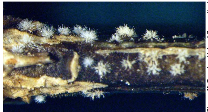
Figure 6. Sporodochia on stem lesion.

This pathogen can complete a life cycle in one week under warm and humid conditions. Fungal growth occurs in a broad temperature range from 41°- 86° F with the optimum temperature for reproduction at 77° F. Like many fungal diseases, moisture is necessary for infection. Free water from dew, irrigation and rain play a part in the severity of the disease and is an element to be carefully monitored. This fungus does not need a wound to infect the plants; it can readily penetrate the cuticle and epidermis. It produces spores in clumps, that can be seen on the undersides of infected leaves and on the black lesions on stems (Fig. 6). The fungus survives in leaves and cankers as well as in leaf debris that has been infected. The boxwood blight pathogen has the ability to persist for long periods of time because of specialized structures called microsclerotia that are present on fallen leaves. The overwintering fungus will produce spores that are capable of infecting host plants under appropriate environmental conditions.