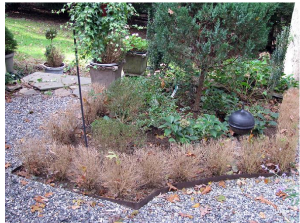
Figure 2. Boxwood blight in a residential property.

To contact an expert in your area, visit msue.anr.msu.edu/experts or call 888-MSUE4MI (888-678-3464)