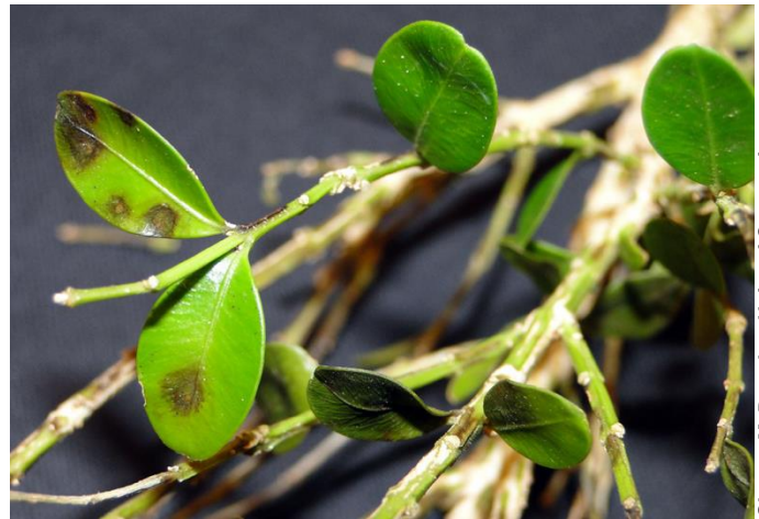
Sharon M. Douglas, Univ. of Connecticut

Proper analysis by a diagnostician from a land grant university or State Department of Agriculture is recommended because boxwood blight symptoms are similar to other boxwood diseases, insect feeding damage and abiotic disorders. It is important to note that this disease can infect boxwood at all stages of production from propagation to finished material as well as landscape plantings (Fig. 1 & 2). Often the first symptom that is noticed is a large amount of rapid defoliation (leaf drop) which is indicative of a severe infection. Generally, part of the plant will become chlorotic or brown, and leaves will rapidly fall to the ground, leaving bare branches behind. Initial symptoms are generally first observed in the late spring or early summer when close examination of boxwood leaves may reveal round, dark or light brown leaf spots with darker borders and potentially a yellow halo (Fig. 3). These spots eventually grow larger and coalesce, before turning brown or straw like and dropping to the ground. Black, elongated, streaking lesions may also be visible on the stem (Fig. 4 & 5). These can occur on the stem from the soil line to the shoot tips. If the weather is humid the underside of the leaf will have a white frosty appearance caused by the formation of upright bundles of fungal spores.