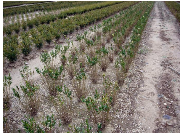
Figure 1. Field-grown nursery plants.

Several genera in the plant family Buxaceae are susceptible to this disease; this includes Pachysandra terminalis (Japanese spurge), Pachysandra procumbens (Allegheny spurge) and Sarcococca species (sweetbox) and of course Boxwood ( Buxus species). There are 95 species of Buxus worldwide, with 4 species and several hybrids and 365 cultivars available in the US. English boxwood, Buxus sempervirens ‘ suffruticosa ’ and American or common boxwood B. sempervirens are highly susceptible to boxwood blight. No boxwood species is known to be completely resistant to infection. Some varieties can show partial resistance however, these partially resistant varieties can harbor the pathogen allowing nearby susceptible varieties to become infected.