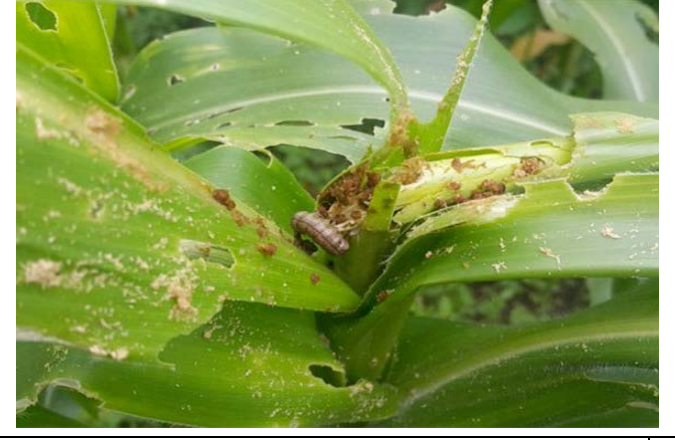
Figure 2. Damage from Fall Armyworm larvae.