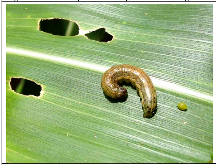
Figure 1. Fall Armyworm caterpillar and damage.