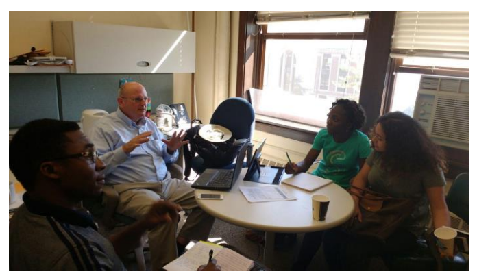
Cross section of poultry value chain meeting at Michigan State University

in Nigeria. Between August and December 2016, members of the team held 10 working meetings on the topic and in preparation for their field work which commenced in December 2016.