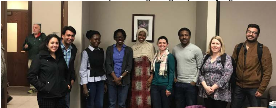
Some of the participants from Mrs. Sule's Brown Bag Presentation

Presentation at the 1) provided invaluable scrutiny of the research theoretical and methodological angles; helping to ensure the validity of the findings. Presentation at 2) provided an ideal opportunity to reach a multi-disciplinary audience and to receive feedback from diverse disciplines; from people who know Africa. The value of this diverse audience provides a broader context to view the research. More than presenting to a group of only Agricultural Economists!