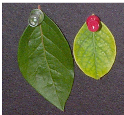
Figure 3. Left: Healthy blueberry leaf. Right: Iron-deficient blueberry leaf. Note the pale green leaf area and contrasting green veins on the iron-deficient leaf. (Photo © Oregon State University. From: Hart, J., D. Horneck, R. Stevens, N. Bell, and C. Cogger. 2003. Acidifying Soil for Blueberries and Ornamental Plants in the Yard and Garden West of the Cascade Mountain Range in Oregon and Washington . EC 1560. Corvallis, OR: Oregon State University Extension Service.)

Guidance on soil acidification for home gardens and small acreages in western Oregon is provided in the following: Acidifying Soil for Blueberries and Ornamental Plants in the Yard and Garden West of the Cascade Mountain Range in Oregon and Washington (EC 1560); Acidifying Soil in Landscapes and Gardens East of the Cascades (EC 1585). For large scale agricultural production, guidance about soil acidification can be found in the following: Acidifying Soil for Crop Production West of the Cascade Mountains (EM 8857); Acidifying Soil for Crop Production: Inland Pacific Northwest (PNW 599). All available in the OSU Extension Catalog ( http://extension.oregonstate.edu/catalog/ ).