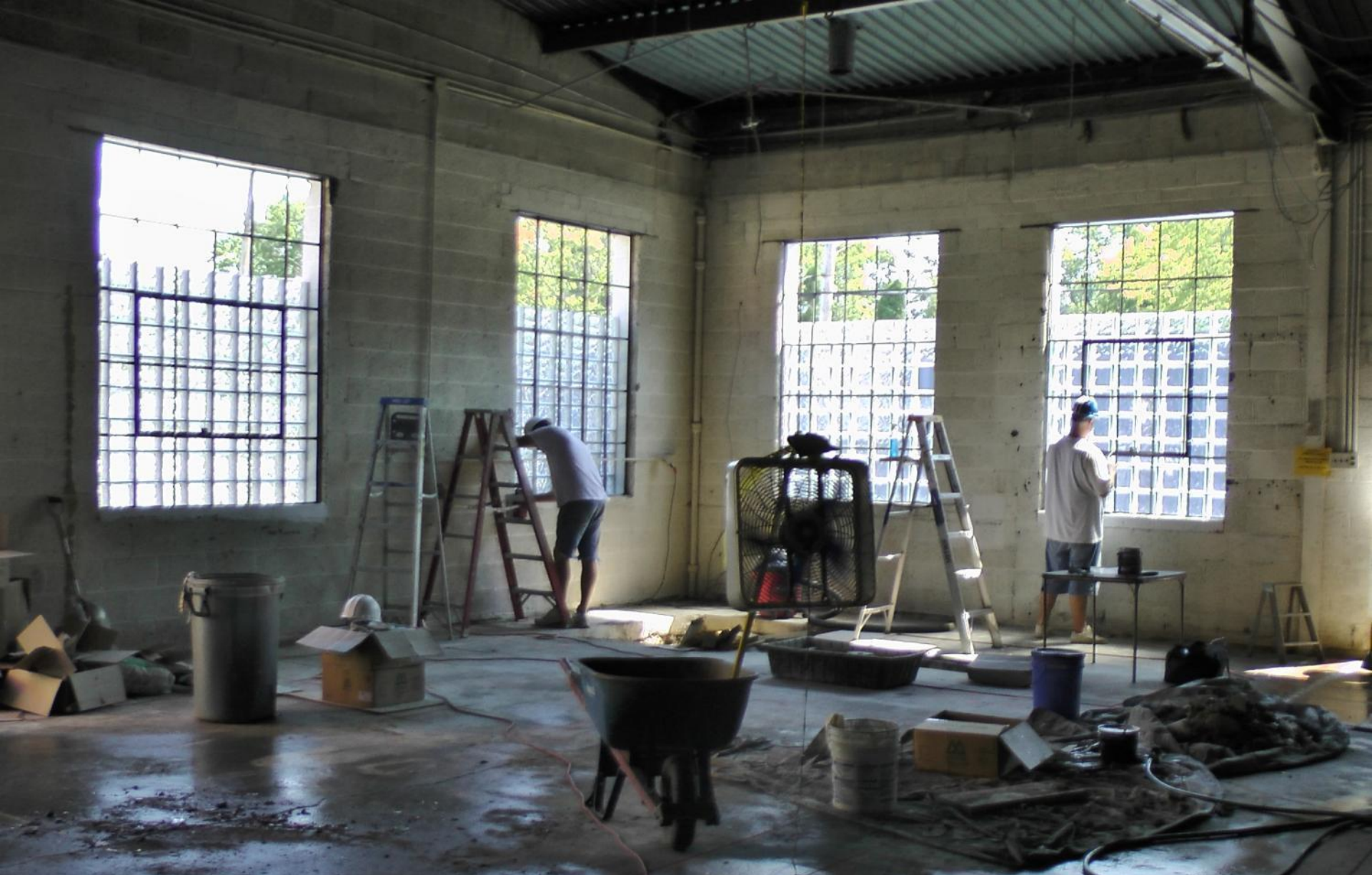
Food Hub – Construction