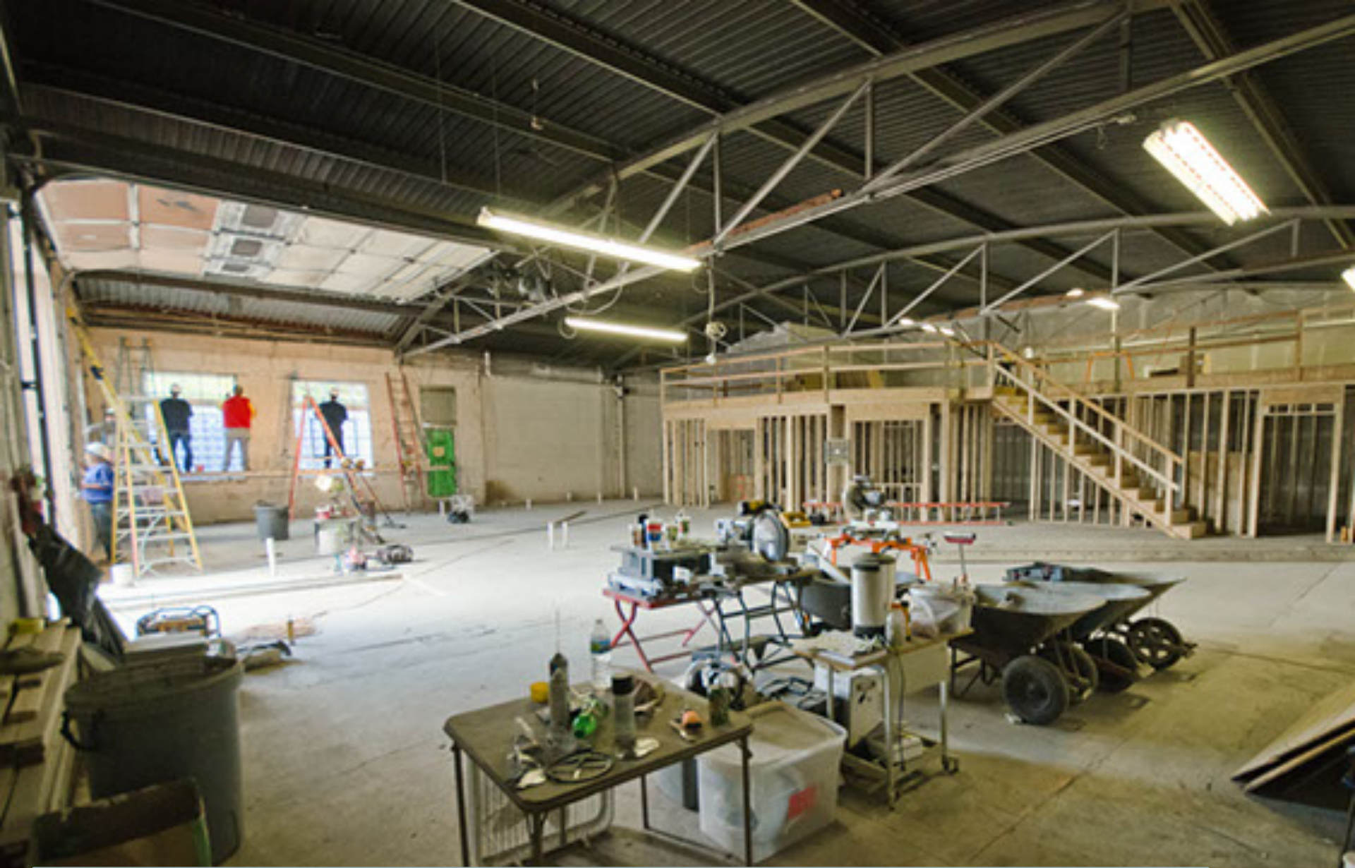
Food Hub – Construction