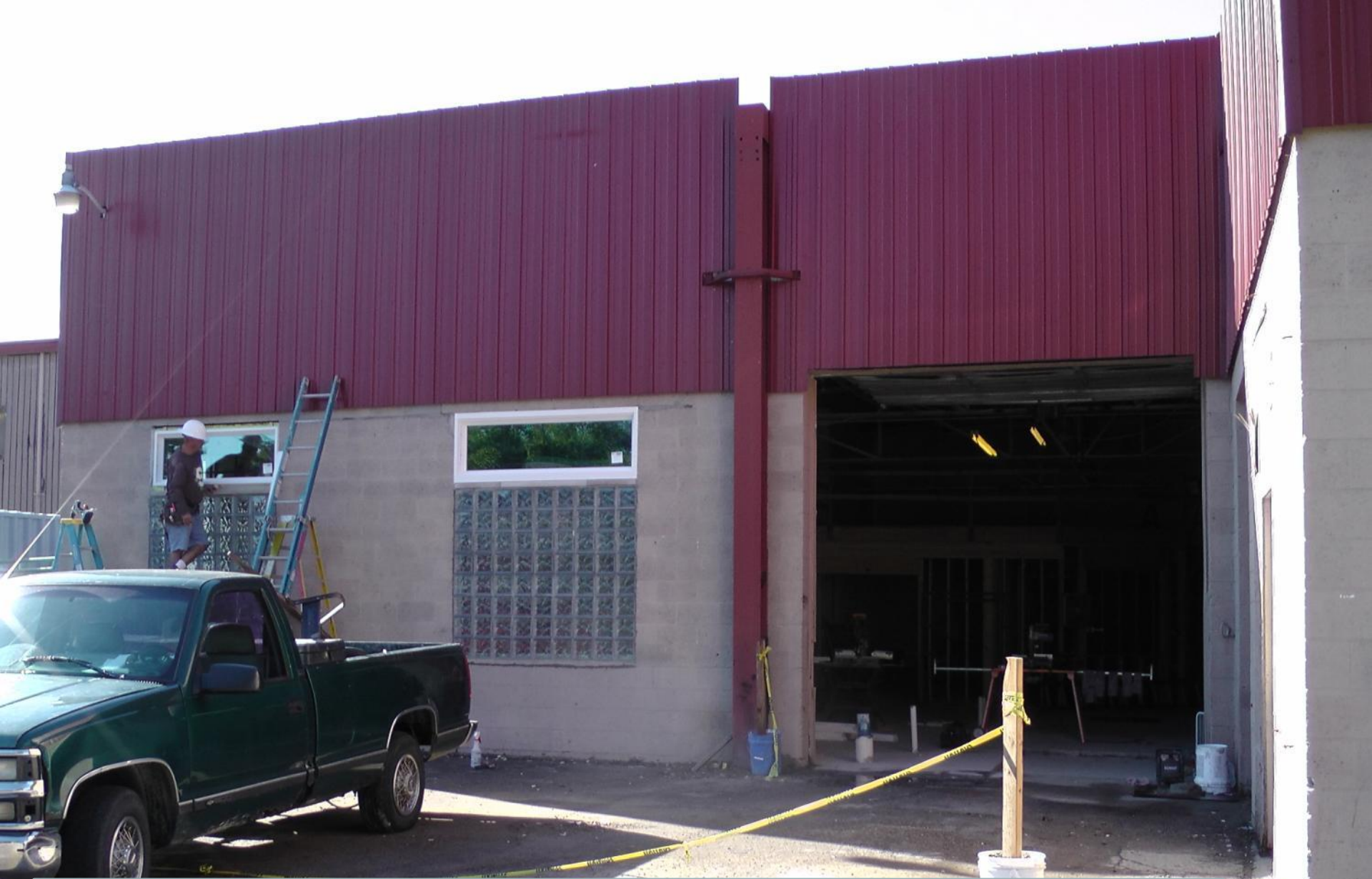
Food Hub – Outside during construction, September