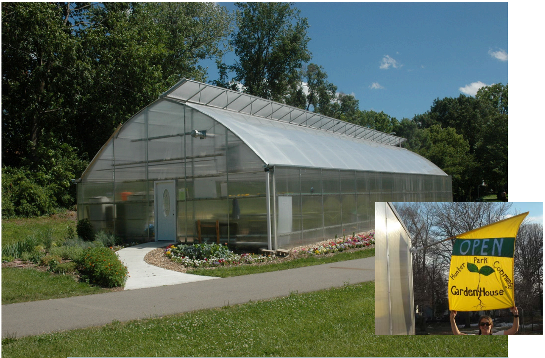
Hunter Park GardenHouse