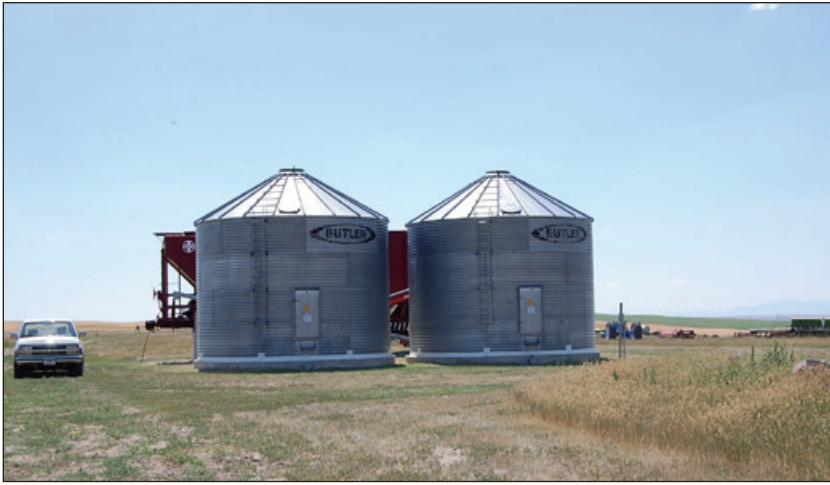
Grain bins.

Cooling grain to below 68°F (20°C) minimizes insect activity. The usual way to do this is to run fans at night when the outside air is coolest. Install a thermostat on the fan, so that it does not operate in the daytime and circulate hotter air into the bin. Set the fan thermostat to 77°F (25°C). When the outdoor temperature drops to this level at night, the fan will start and the grain will begin to cool. It may take several weeks to cool the grain to 77°F. Then in September, cool the grain down to 68°F (20°C) as the nights cool off even more. Finally, cool the grain down to 59°F (15°C) and let it stay there the rest of the time it's in storage. It is very important to cool grain down as soon as possible so that the insects have less time to develop under warm, favorable conditions. These specific temperature points can vary in a colder environment that has later harvests, but the concept remains the same.