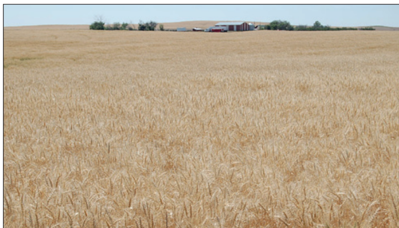
Organic winter wheat at the Quinn Farm, Big Sandy, MT.

The second tier in the hierarchy is mechanical and physical methods that may include introduction of natural predators, natural traps, and repellents, and development of habitat for natural enemies.