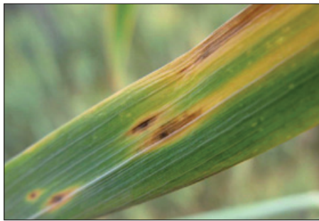
Tan spot on wheat.

Tan spot and septoria are fungal leaf diseases that are widespread in wheat, but are not as serious as other diseases. These fungal pathogens survive on the infected residue of a previous wheat crop. In the spring, the fungal fruiting bodies will produce spores that infect the newly planted seedlings, thus perpetuating the disease cycle. Incorporating infected plant residue will reduce the spread of these diseases.