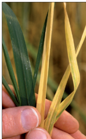
Barley Yellow Dwarf Virus.

Providing habitat for mite predators such as spiders and carabid beetles can also help prevent spread of the disease. Create a mulch of plant