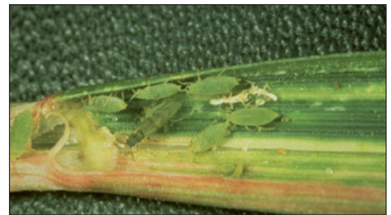
Russian Wheat Aphid.

Another major in-crop insect pest for small grains is the Russian wheat aphid (RWA). The Russian wheat aphid affects grain by injecting a toxin that damages the plant, typically resulting in a white stripe running down the leaf blade. Several resistant varieties have been developed and are used extensively in Colorado, Kansas, and Texas, where warm temperatures allow for greater RWA survival. Most grain in Montana and North Dakota does not have this resistance. These states escape serious aphid infestation because their cold northern climates delay aphid migration, although climate change may affect this. University of California IPM Pest Management Guidelines point out, “Wheat and barley are the most susceptible; rye and triticale, while susceptible, are usually less damaged; and oats appear to sustain little or no injury. Russian wheat aphid does not attack corn, sorghum, or rice” (Summers et al., 2009). A diverse crop rotation can help minimize Russian wheat aphid damage across an entire farm.