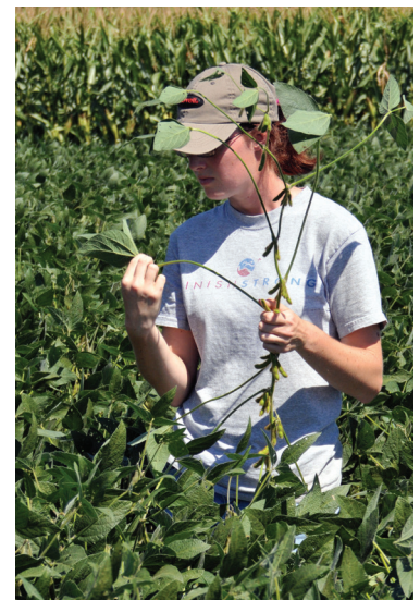
Figure 9. Scouting for insect pests is the tried and true approach.

Growers frequently face limited choices regarding seed treatments. Popular soybean varieties are often offered only with a pre-applied package of seed treatments. Growers who desire untreated soybean seed, or seed treated only with fungicides, should let their seed dealers know as early as possible when ordering seed for the next growing season.