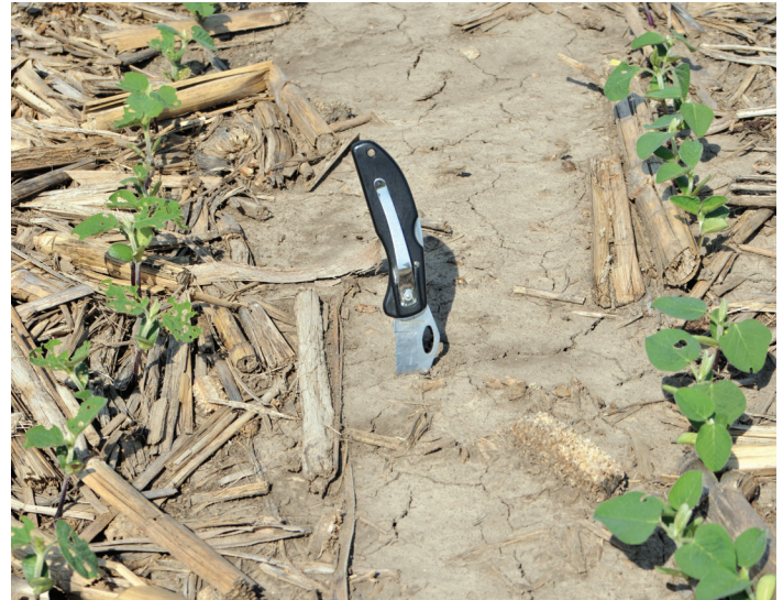
Figure 3. Early-season bean leaf beetle feeding on untreated soybean seedlings (left) and on neonicotinoid seed-treated seedlings (right). This minor feeding does not reduce yield.

The U.S. EPA extensively reviewed published and unpublished data regarding the yield benefits and concluded that “neonicotinoid seed treatments likely provide $0 in benefits to growers” (USEPA 2014).