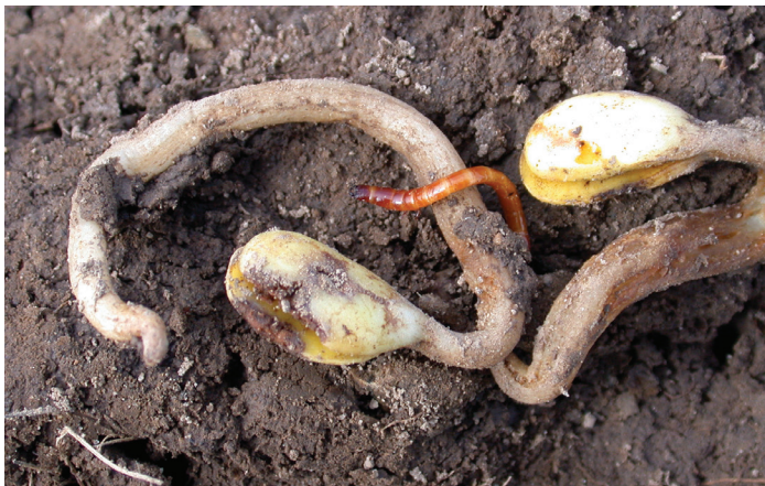
Figure 2. Wireworm feeding seldom reaches economically damaging levels.

These high-risk scenarios are uncommon in northern states. Seed and seedling pests such as wireworms, white grubs, and seedcorn maggots rarely reach economically damaging levels in the vast majority of soybean fields (Figure 2). Adult bean leaf beetles are