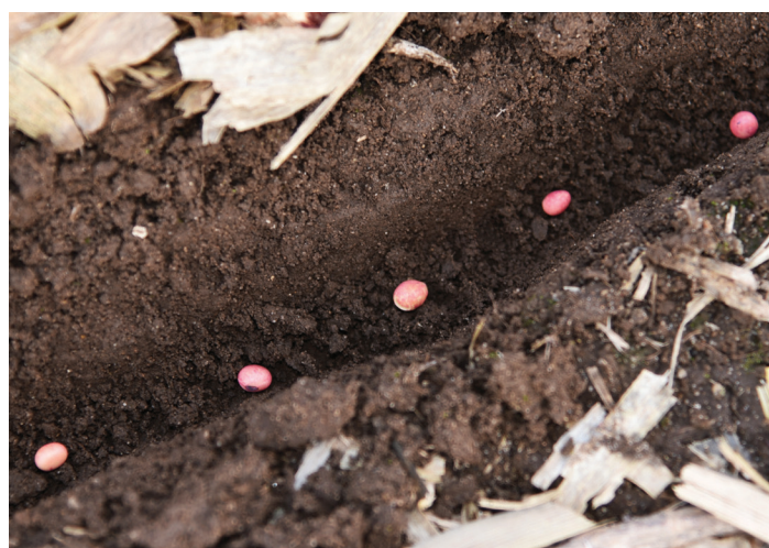
Figure 1. Neonicotinoid-treated soybean seed before soil covering.

This publication reviews the current research regarding the efficacy of these neonicotinoid seed treatments, their non-target effects, and the potential role for neonicotinoid seed treatments in soybean production.