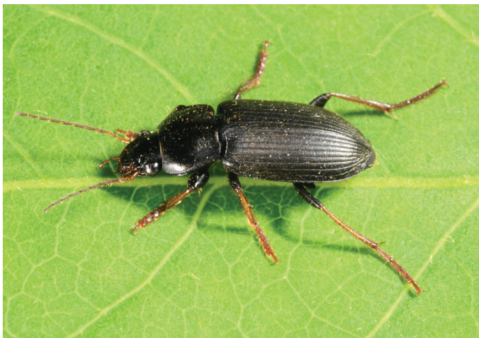
Figure 8. Ground beetles typically control slug populations. But slugs that feed on plants grown from neonicotinoid-treated seeds can pass the insecticide to the beetles.