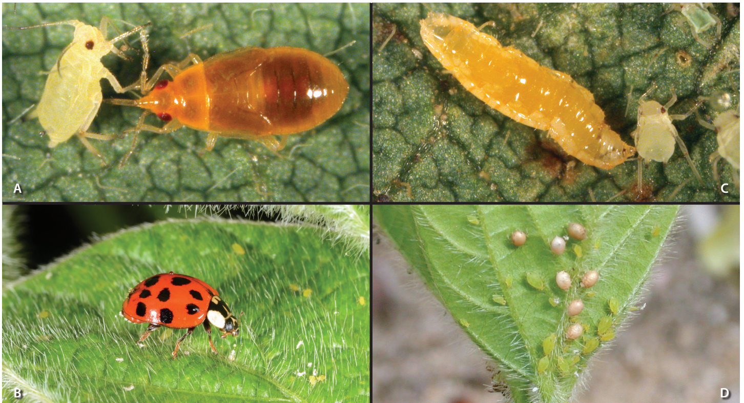
Figure 5. Predators, such as (A) an Orius nymph, (B) Asian lady beetle, (C) aphid midge larva, and (D) parasitic wasps typically suppress early-season infestations of soybean aphid.