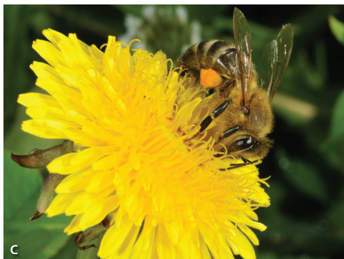
Figure 6. (A) Planter dust generated when planting treated seed contains a very high concentration of neonicotinoids that (B) can move off-target, and (C) potentially harm beneficial organisms.