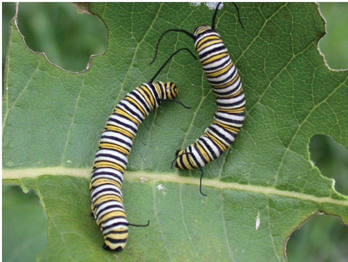
Figure 7. Non-target plants (such as milkweed) can absorb neonicotinoid residues and affect non-target insects (such as monarch butterfly caterpillars).

The same study demonstrated that in slug-infested fields, soybean grown without neonicotinoid seed treatments produced higher plant populations and yields than their treated counterparts. This study has important management implications, since slugs are emerging as a key pest in no-till cropping systems in many parts of the northern soybean production region.