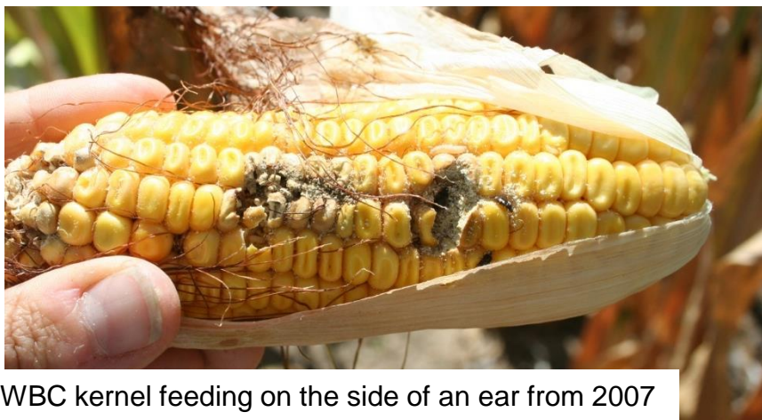
WBC kernel feeding on the side of an ear from 2007

Gray shading: Counties trapped for WBC XX: Total number trapped per county Yellow shading: Counties with confirmed WBC damage