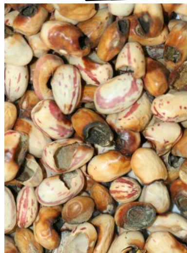
Cranberry beans fed on by WBC from Montcalm Co, 2008 season