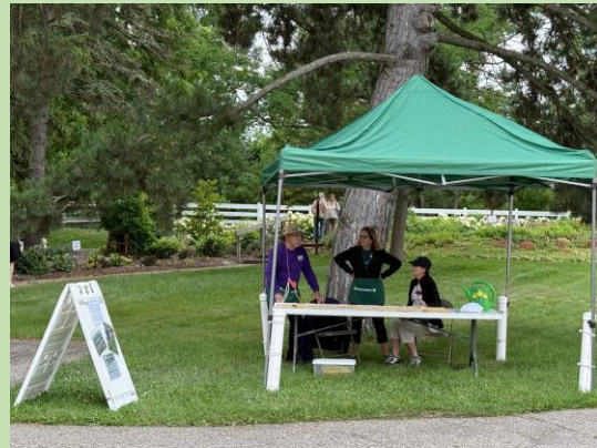
Top 2 photos by Renee Cottrell