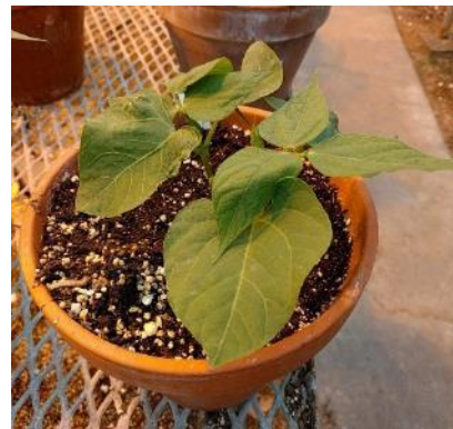
↑ Healthy plants with dark green leaves