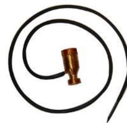
↑ A liquid fertilizer injector