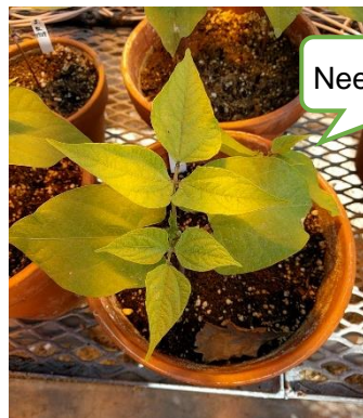
↑ Hungry plants with light yellow green leaves