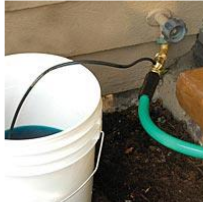
↑ Attach a liquid fertilizer injector between the faucet and the hose. Water normally.