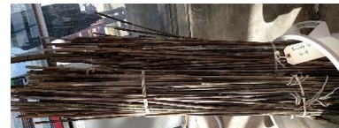
↑ Bundled and tagged stakes