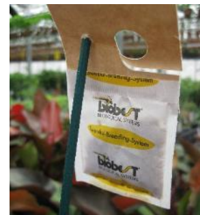
↑ A thrip bag