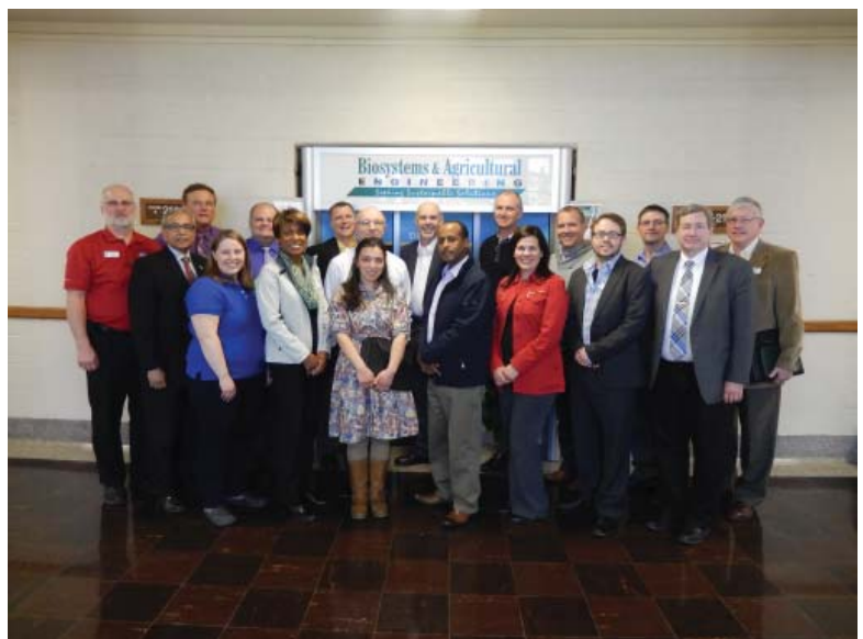
2014-2015 Industry Advisory Board