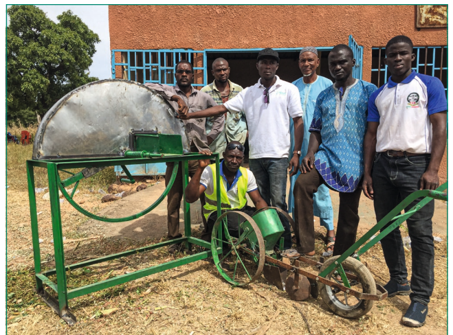
Figure 4 – Local artisans developed skills in building and repairing planters and other implements with local materials

Appropriate scale technologies must be accessible to smallholder farmers. Mechanization and mechanical skills are insufficient at the farm and village levels. The supply chain and infrastructure for timely access to replacement parts, services, and repairs for imported equipment is generally nonexistent. There is a need to develop the mechanical skills of farmers and local artisans to efficiently use animal power. Worldwide, where mechanization took hold, the process has been stepwise and incremental, resulting in less labor-intensive farming systems. In our experience, improving tools for animal traction is one of the best ways to improve the lives of poor farmers while sustaining the natural resource base.