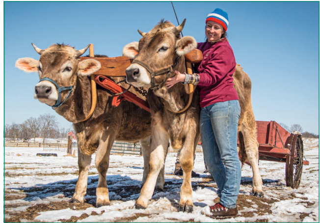
Figure 17 – Tillers International draws on historical examples of functional farming tools and implements to help local communities produce affordable tools

a collection of historic farm implements. In practice, we help communities locally produce affordable tools. Historically, human or animal-powered devices – simple though sophisticated – are easy to replicate without a significant investment in manufacturing facilities. Repair parts can be fashioned affordably by local artisans ensuring availability when the growing season demands.