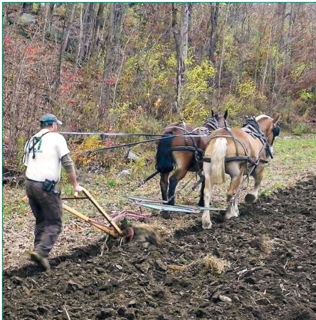
Figure 12 – Carl maximizes profit by keeping costs within the capabilities of animal-based production rather than through increased mechanical production to cover higher costs

One of my strategies for using draft animals most effectively in our operations has been to engineer the scale of work to reduce their role to the most appropriate tasks. Our land-use systems that require motive power are purposefully limited to a scale that fits our animals' time and energy constraints and capabilities and affordable associated equipment.