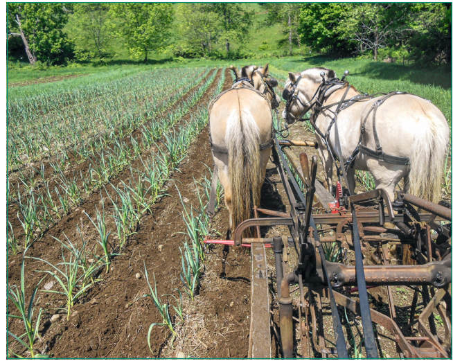
Figure 13 – Cultivating garlic with a team of Fjords at Cedar Mountain Farm

Stephen Leslie is a co-owner of Cedar Mountain Farm and Cobb Hill Cheese, located in Hartland, VT. The farm produces milk, beef, mixed vegetables, and compost.