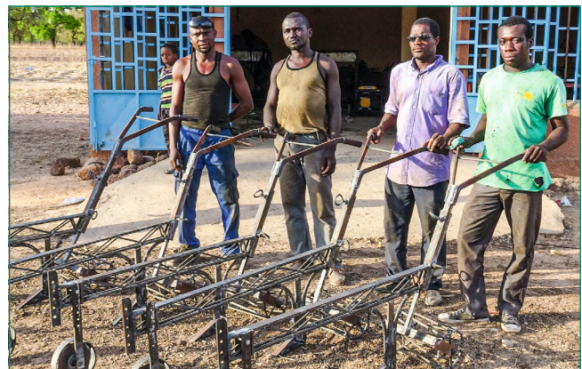
Figure 6 – Local artisans are collaborators actively involved in setting priorities, evaluating alternatives, and sharing work results