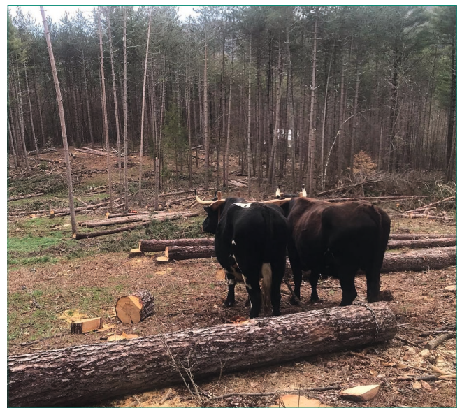
Figure 11 – Draft animal power is well integrated into the farming system at Earthwise Farm and Forest

Carl B. Russell and his wife, Lisa McCrory, own and operate Earthwise Farm and Forest in Bethel, VT. They raise organic vegetables and grass-fed livestock, use draft animals for logging and fieldwork, and offer workshops on skills for sustainable livelihoods.