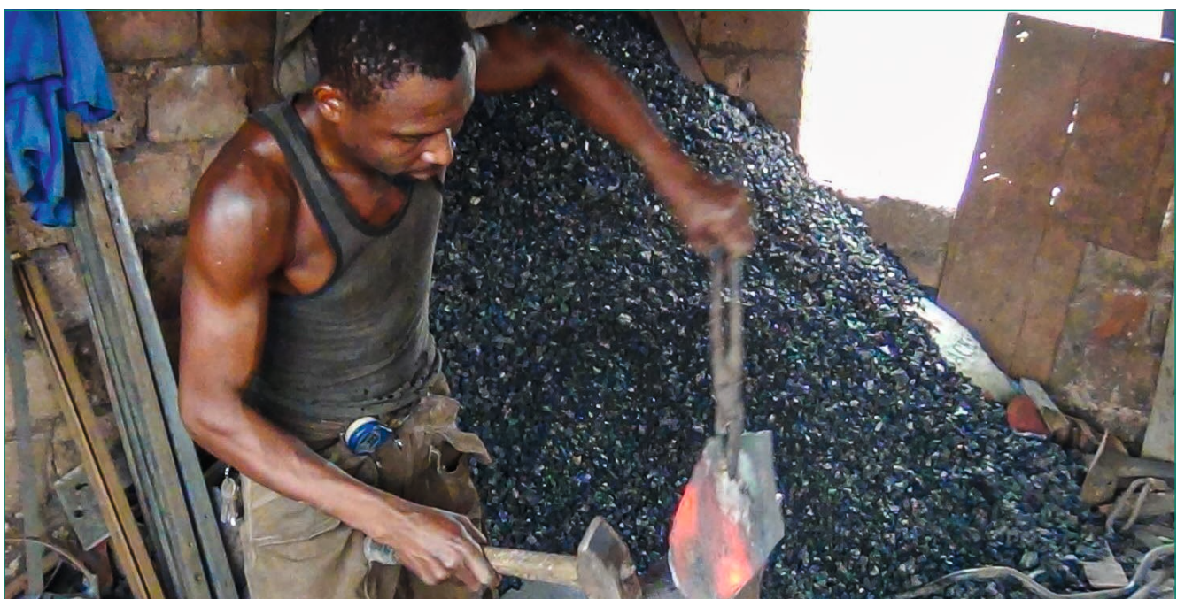
Figure 7 – Rather than importing expensive technologies, we worked alongside local artisans to enhance their knowledge, skills, and abilities to build and repair equipment using locally available materials