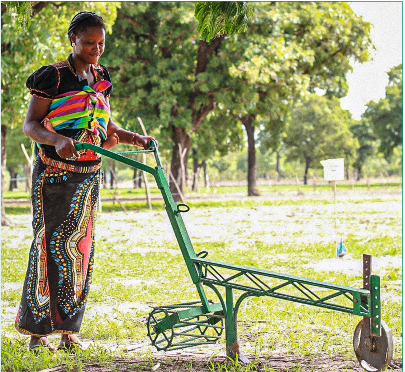
Figure 8 – Strip-tillage builds soil health by conserving soil moisture, reducing tillage intensity, and retaining a protective crop residue on the soil surface

Our approach to redesign farming systems is agro-ecological – a production system, not a simple technology. Machines and draft animals are part of a broader system where ecological and social benefits are valued and sought after. Our goal is to offer flexible options compatible with the local economic, social, and environmental conditions and enhance the farming system's efficiency and resilience. Our approach is participatory. Local farmers and artisans are collaborators actively involved in setting priorities, evaluating alternatives, and sharing the work results. Participatory development enhances farmers' capacity to learn about farms and resources.