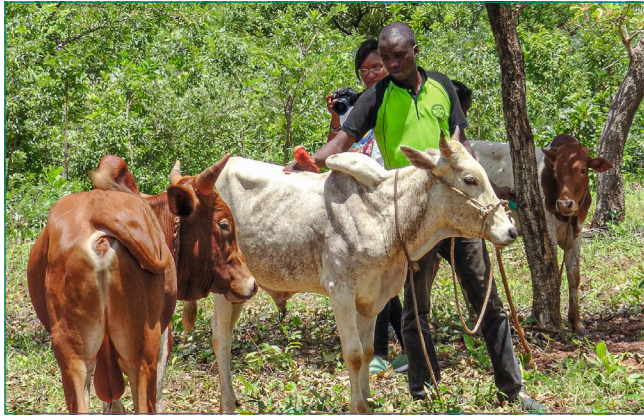
Figure 9 – The implement draft dropped from 90 kgf with the moldboard plough to 45 kgf with the strip tiller, easing the burden on the local small-framed oxen

In an adaptive management process, we built and evaluated a set of technologies compatible with the local economic, social, and environmental conditions. We redesigned an animal-drawn planter introduced decades earlier but widely rejected by local farmers because of the high cost and poor performance. We reduced the cost of the planter by 50 % by replacing an expensive imported spiral bevel gear drive with an open spur gear drive built on-site by local blacksmiths. We had made mold-injected seed plates for maize, sorghum, millet, and cowpea and an innovative furrow opener to place the seed at the correct depth. Locally built, concave discs well suited for clearing crop residue without plugging replaced the high crown furrow closers on the old-style planter. Finally, we reduced the press-wheel width by 50% to provide localized pressure to firm the soil in the narrow seedbed created by the in-line ripper. The refined planter's average implement draft was 20 kilogram-force (kgf), a manageable load for even a single donkey.