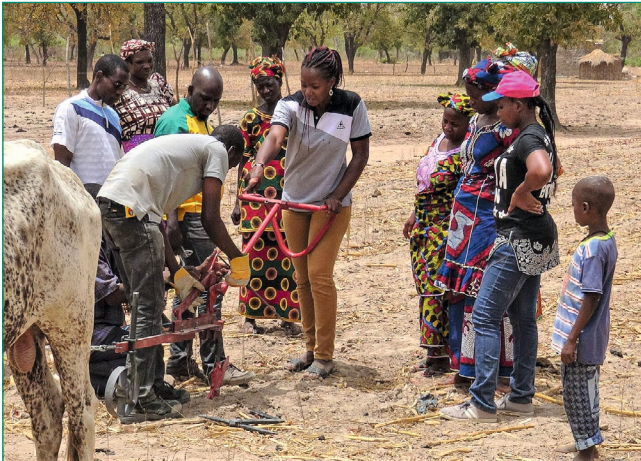
Figure 3 – Interaction and collaboration with local farmers is essential in understanding opportunities to redesign local farming systems

efficiency, 2) substitution, and 3) redesign 5 . Efficiency is in targeted placement and tighter control of fertilizer and crop inputs to improve crop response. Substitution replaces existing technologies with more effective ones such as improved crop varieties or no-till cropping rather than inversion tillage. A redesign aims to deliver "the optimum amount of ecosystem services to aid production while ensuring that agricultural production processes improve the ecosystem they depend on." A redesign can strengthen the agroecosystem by adding regenerative components.