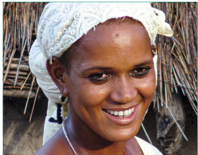
Figure 10 – Time saved with the planter allowed women to divert time from subsistence farming and household chores to income-generating activities such as processing shea butter or cashew nuts

Agroecological concepts ground our approach to farming systems redesign. Evaluation is technical but viewed in social, cultural, and economic contexts. After one or two seasons of use, a group of women commented on the time and laborsaving impact of the animal-drawn planter on their lives. They noted that a family of three with a team of oxen could accomplish the work of a hand-planting crew of 15-20 laborers. The women used the time saved with the planter to perform other domestic tasks such as cooking, fetching water, child-care, and going to the market 7 . They could divert time from subsistence farming and household chores to income-generating activities such as processing shea butter or cashew nuts. Income from their off-farm enterprise funded children's schooling, food, and clothing. In addition, they saved money for unexpected expenses such as medical care and other family emergencies.