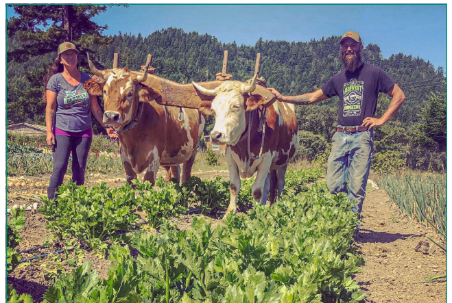
Figure 19 – The 2.5 ha tillable tract of mixed vegetables matches human and animal work and time constraints. Two covered greenhouses extend the growing season to a year-round operation

We transitioned from tractor to ox power, from conventional intensive tillage (plow, disk, fit, plant) to draft animal-appropriate, reduced tillage, raised beds. Most vegetable gardens in the region are smaller (one-quarter hectare or less) than our 2.5 ha plot. Ox power gives us longer and stronger arms--a level of tractive efficiency greater than human power or two-wheel tillers, but right-sized for our time and land base. Most of the implements used in the garden are modern, multi-purpose or vintage tools modified to achieve specific tasks. The goal is to have a one-person operation for the fieldwork.