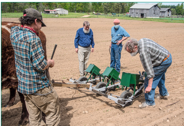
Figure 16 – Field-testing a three-row, ox-drawn planter at Tillers International