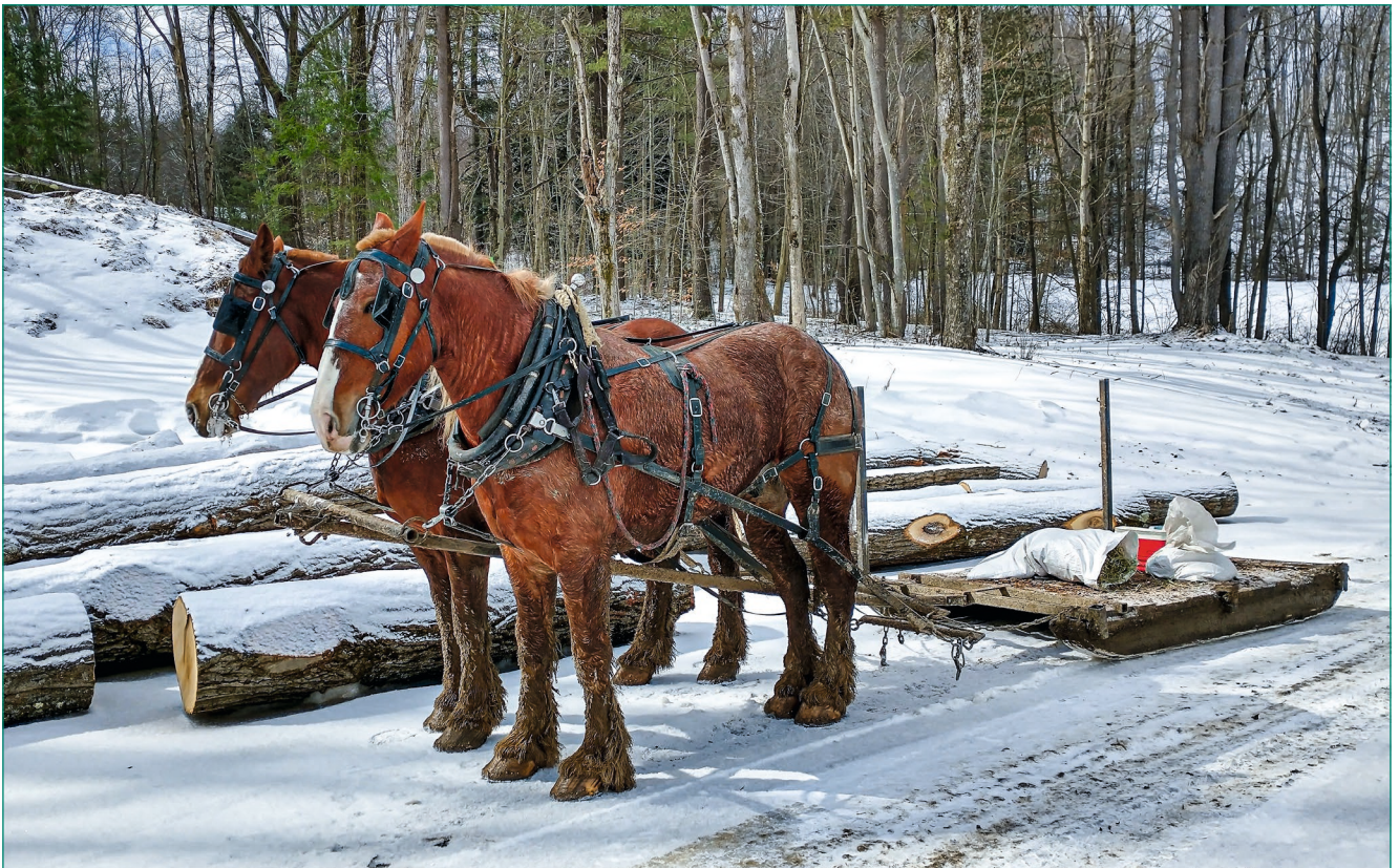
Figure 15 – An Amish-owned team of horses waits patiently while the logging crew breaks for lunch

This is not to say that farming with horses is a life of idyllic