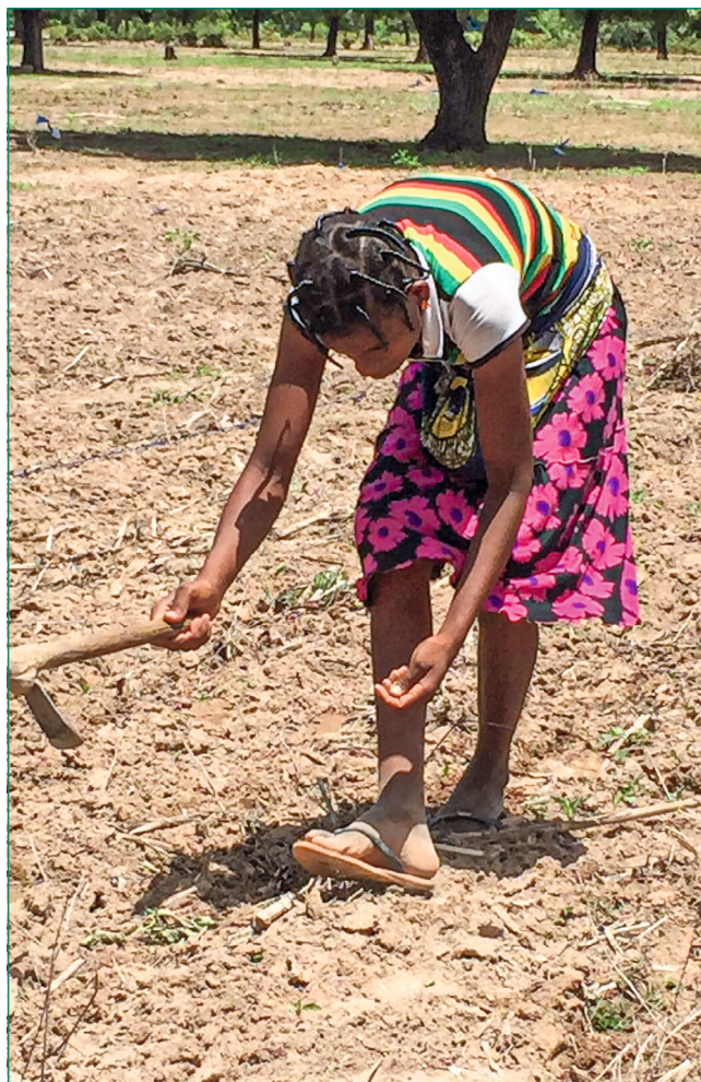
Figure 2 – Young Burkinabé woman planting maize by hand with a 'daba'

Our recent work in Burkina Faso, a small, landlocked country in West Africa, is an excellent example of where animal traction is the most appropriate technology. Ninety-two percent of the population of Burkina Faso is involved in agricultural pursuits 4 . Smallholder farmers typically work less than 3.5 hectares of land, mid-size farms are about 7 hectares, and large farms are 10 hectares. Forty-five percent of the farms have an income of less than $3 per day. Nearly the entire rural population relies on subsistence farming and lives in poverty.