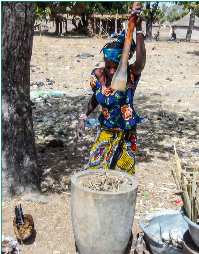
Figure 5 – Mixed power sources on the same farm are common. Women process millet by hand to satisfy texture and taste preferences

Most smallholder farmers suffer from chronic low income. Few farmers can use wheeled tractors profitably because farms are small, farmland for expansion is scarce, and farm labor is readily available. In many areas, roads resemble little more than wide footpaths. Access for wheeled vehicles is challenging and, at times, impossible. Even in adverse weather, draft animals can navigate narrow trails and rugged terrain. In wet fields, draft animals are less damaging to soil than wheeled tractors.